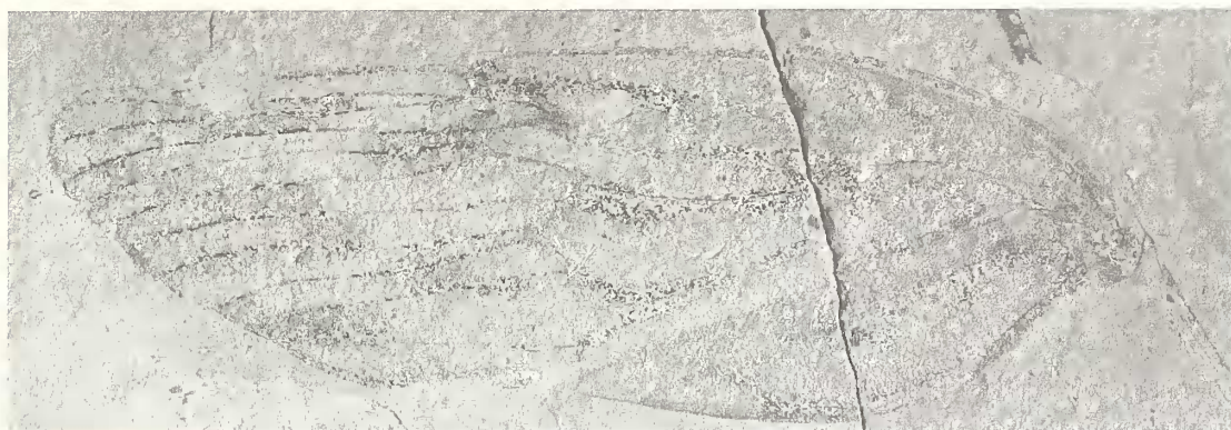
TEXT-FIG. 3. Holotype; specimen 9152 a; \times 5 .